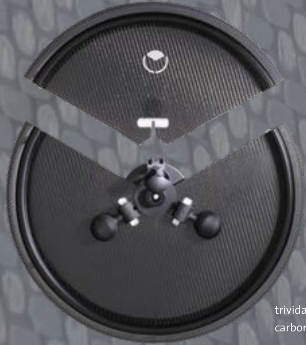
trivida® carbon wheel