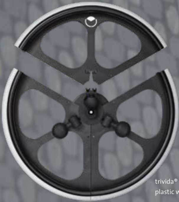
trivida® plastic wheel